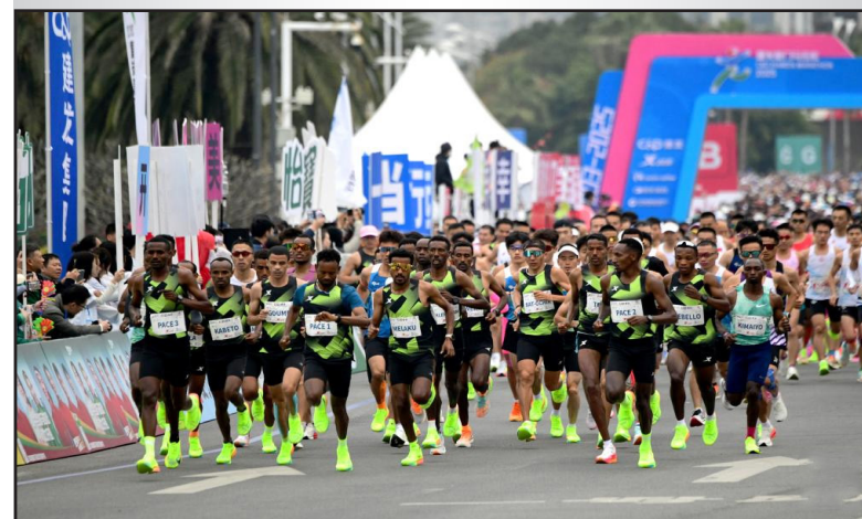
Runners participate in the 2025 Xiamen Marathon on Jan 5, 2025.